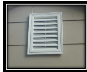
Gable Vents: 45