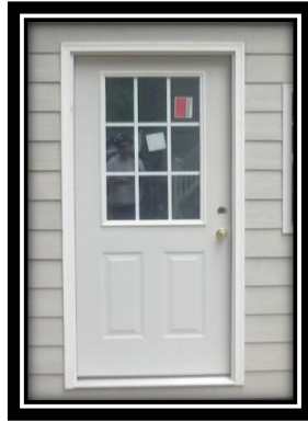
9-light Door: $200/ea