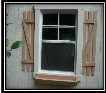
Aluminum Windows: $80 (With grids and screen) Flower Box: $25