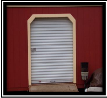
5x7 Rollup Door: $375