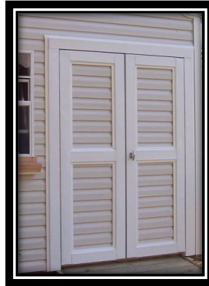
Vinyl Layover: $100/ea