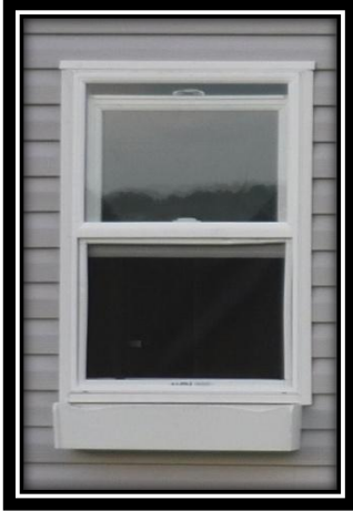
Vinyl Windows: $125 (Tilt- in with screen)