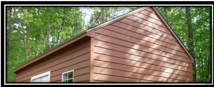
Boxed Eaves (Front/Back): 200 Sheds over 192 sq ft. : $350 (Wood siding) Boxed Eaves (Front/Back):265 Sheds over 192 sq ft. : $385 (Vinyl siding)