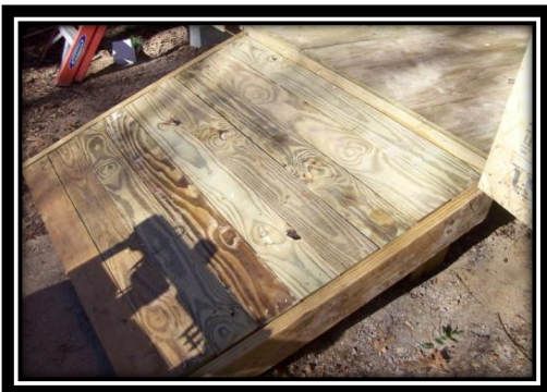
2x6 Heavy Duty Tung & Groove Ramp: $125