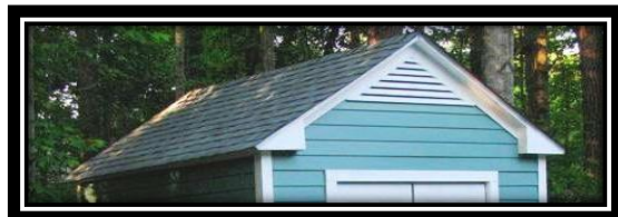
Decorative End Caps: $25/ea