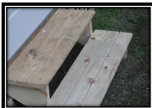
(2) Steps: $45