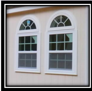
Half-Moon Windows: $80