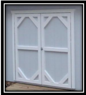
Decorative Wooden Door Trim: $20/door