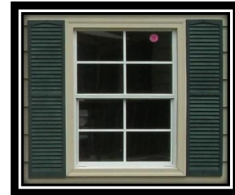
Shutters: $30/pair (Wood or vinyl) Paintable, come white